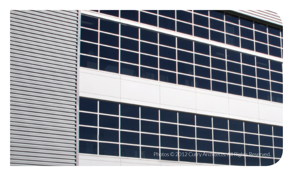
Mustang Stadium includes a turf field for football, field hockey, lacrosse and soccer. The signature element of the building is the exterior brick, metal and glass façade that was fabricated with approximately 2,700 square feet of Solarban® R100/Solargray® glass by Vitro.

Working with a glazing contractor and mechanical engineer, Kulp determined that specifying Solarban® R100/Solargray® glass for